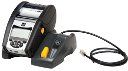
Single-bay QLn Ethernet Cradle