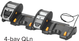
4-bay QLn Ethernet Cradle

Connect QLn printers to your wired Ethernet network via the QLn Ethernet cradle to enable easy remote management by your IT or operations staff — helping to ensure each printer is operating optimally and ready for use. The Ethernet cradle can communicate over 10 mbps or 100 mbps networks using auto-sense.